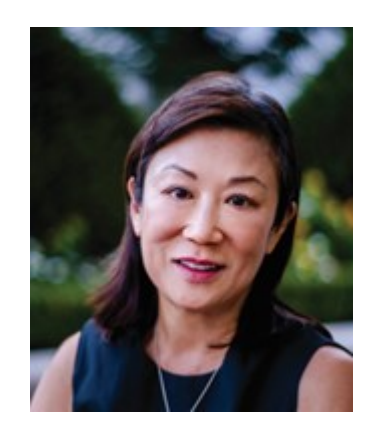
Associate Chief of Professional Practice, Justice, Legal & State Advocacy, APA